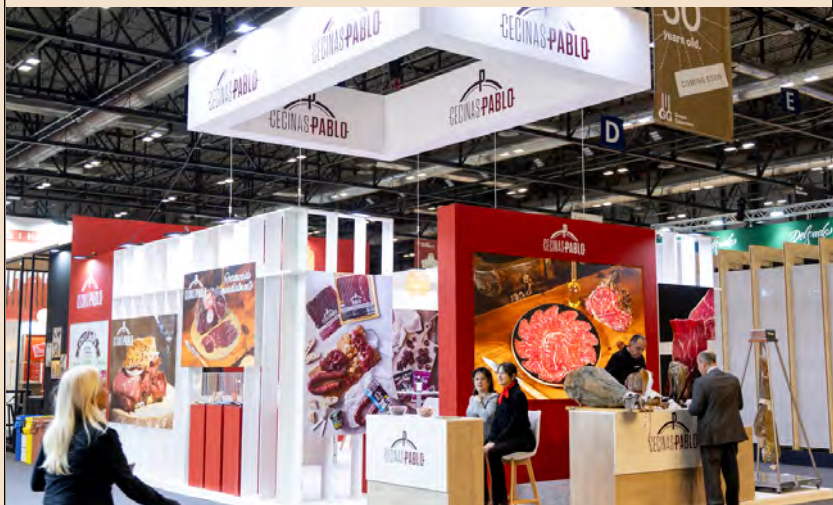
38 Salón Gourmets