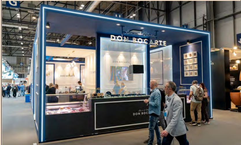
38 Salón Gourmets

Enrich your participation and brand presence: