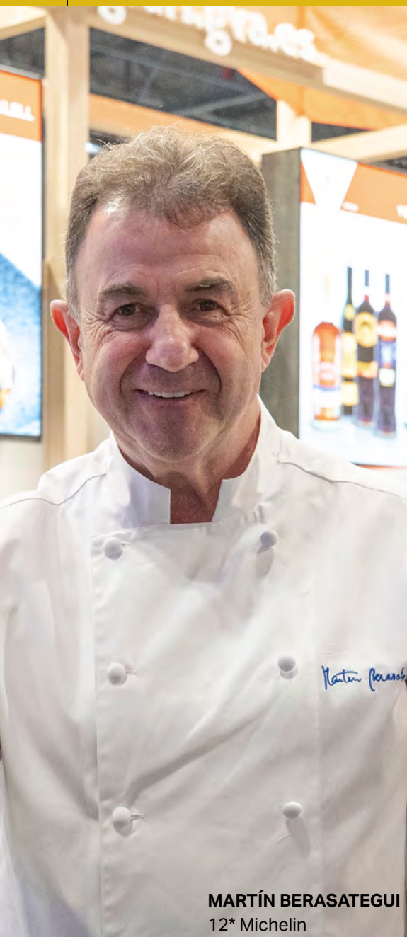
MARTÍN BERASATEGUI 12* Michelin

Salón Gourmets is a one-of-a-kind event that has marked a turning point in the world of gastronomy, both in Spain and internationally. It has made history, and I'm proud to have attended every year. Keep up the great work! MARTÍN BERASATEGUI , 12* Michelin / Spain