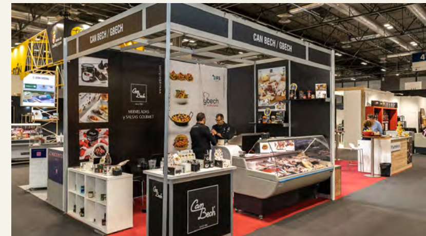
Note: Non-binding image.

“TurnKey” stand which includes all the necessary elements to exhibit your products and to attend the professional visitors. The structure and equipment are fixed and vary according to the size, minimum 9 m 2 .