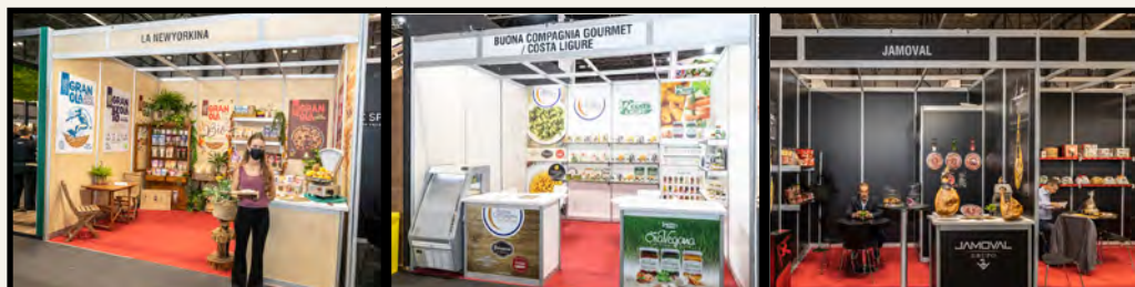
Note: Non-binding image.