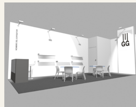
24 m 2 Stand