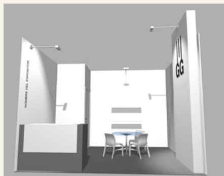
12 m 2 Stand