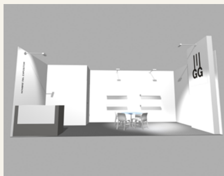
21 m 2 Stand