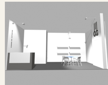
18 m 2 Stand