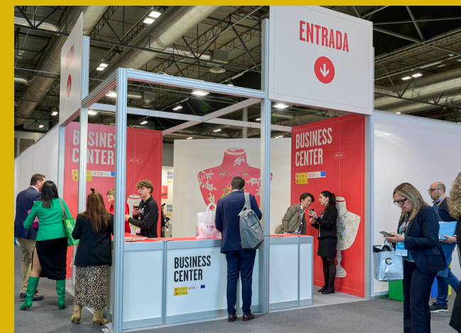
Note: Non-binding image

more than 300 import companies participated, 60% of which were new to the fair, holding 6.482 meetings, consolidating steady growth in international buyers