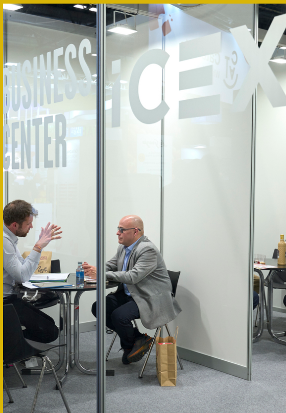
Note: Non-binding image

International buyers invited by the Organization.