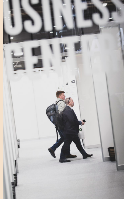
Note: Non-binding image