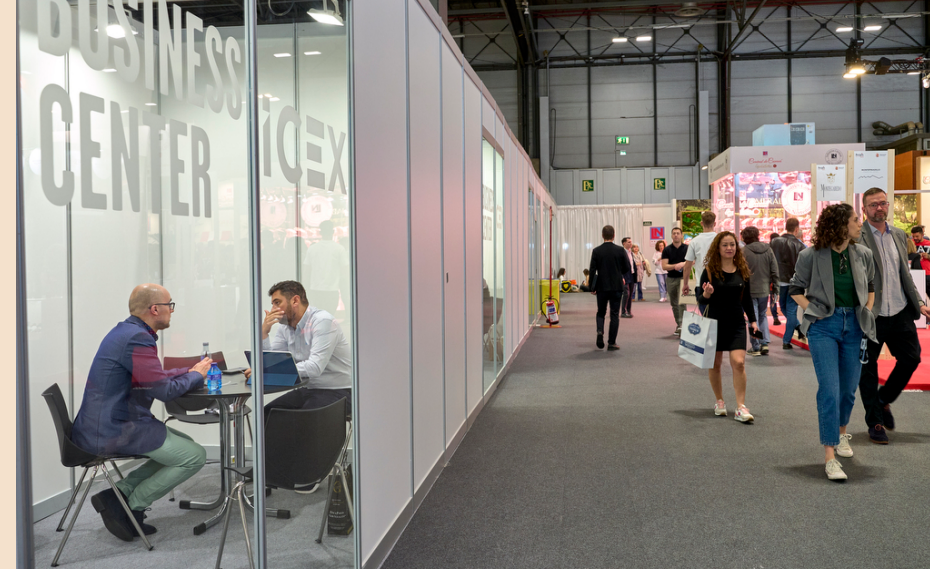
Note: Non-binding image